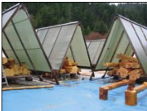
West Coast Log Homes

Many builders prefer to harvest logs in late fall or winter to reduce fungal and insect problems. In the winter, the sapwood has low levels of nutrients (sugars and starches), which would otherwise encourage fungal growth. Also, bark beetles are dormant in winter. Some builders feel that an additional advantage to winter felling is the possibility of less checking, due to a belief that the initial moisture content (MC) of the tree is lower in winter than in summer and there is less difference in MC from heartwood to sapwood. Actually, the tree's MC is lower in the summer due to heavy demand by the needles for water. But this has no relevance, as checking only occurs when parts of the log get below the fiber saturation point (FSP), and the live tree's MC is far above FSP in all seasons. However, one wintertime factor can have a beneficial effect on checking. Slower evaporation in cold winter weather can reduce the drying stresses inside the log, which can reduce checking.