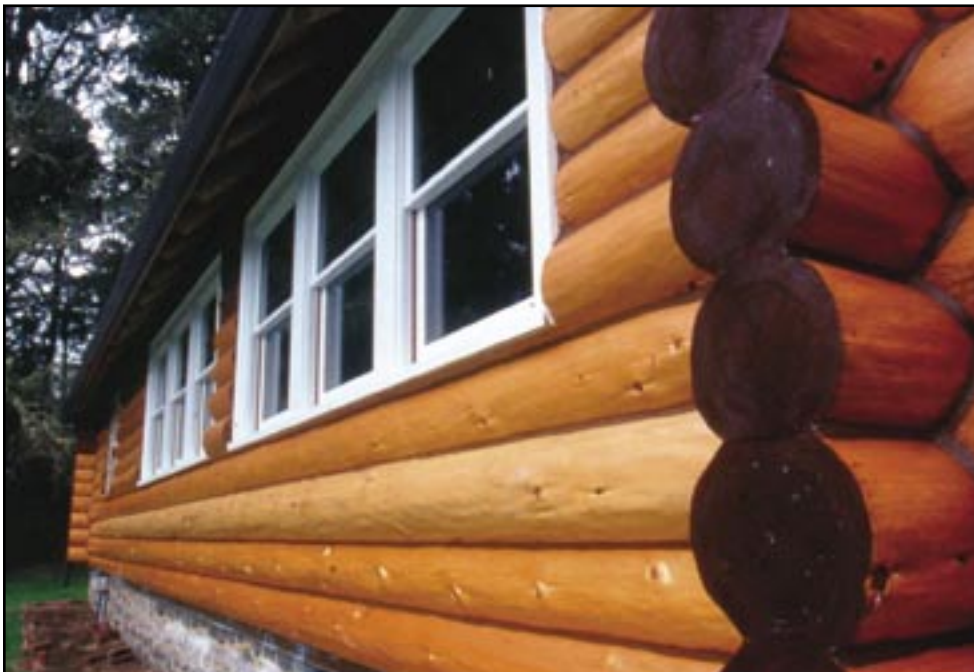
Restoration: David Rogers, Logs & Timbers.

This restoration of a historic 1937 building required extensive repairs and refinishing. It's far better and easier to maintain a building in the first place than to face an expensive restoration later. The log rot would have been prevented by borate rods, if they were available at the time the rot started.