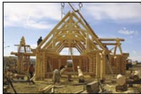
Moose Mountain Log Homes Inc.

In order to protect the logs from dirt or iron stain, some log home exporters use plastic liners when shipping by container. Some builders also find dried logs stay cleaner during shipping if they are first given a base coat of finish.