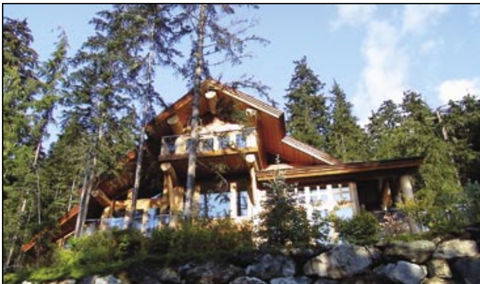
Canadian Building Restoration Products Inc.