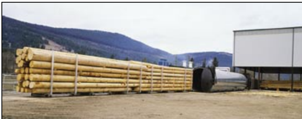
Unique Timber Corp., Brian Lloyd Photography

One manufacturer's approach to safe storage of logs in a wet climate includes protection from rain, ground moisture and ultraviolet exposure.