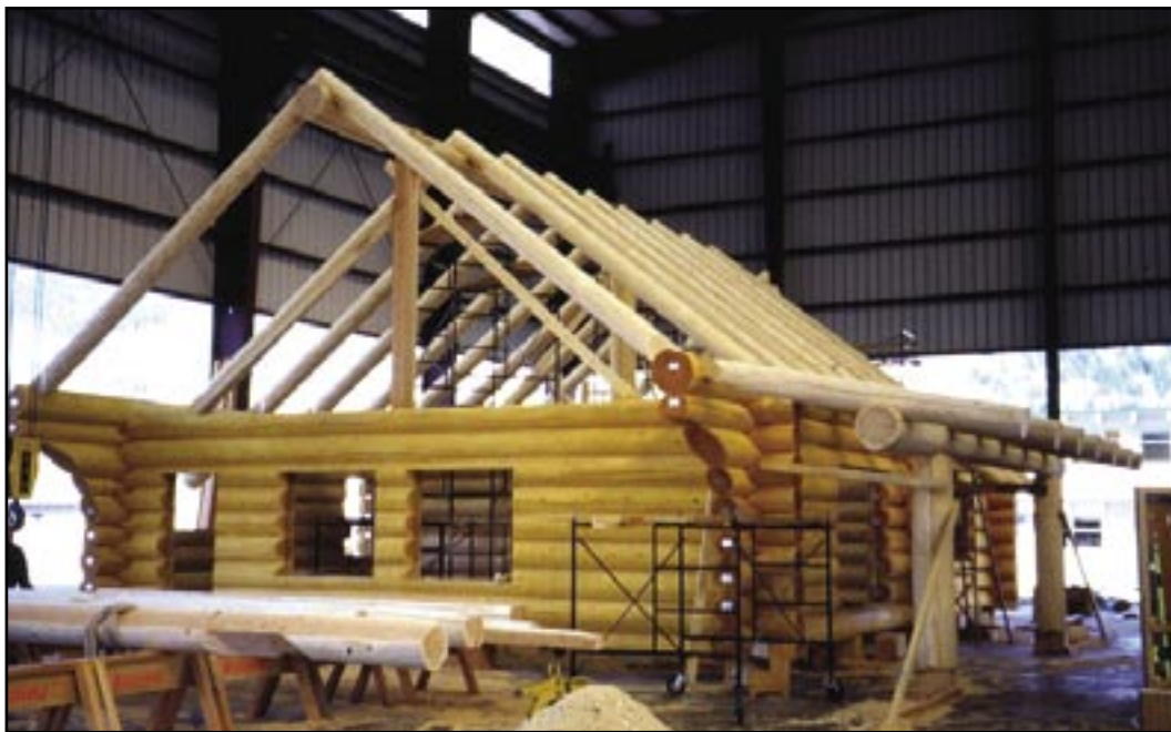
Unique Timber Corp.

If logs in storage are at risk for mold growth, they should be treated with a sapstain control product approved for use on logs - see the section on log treatment. If logs start to discolor from mold, they can be pressure-washed. As the logs dry down during seasoning, they will be less likely to support mold growth.