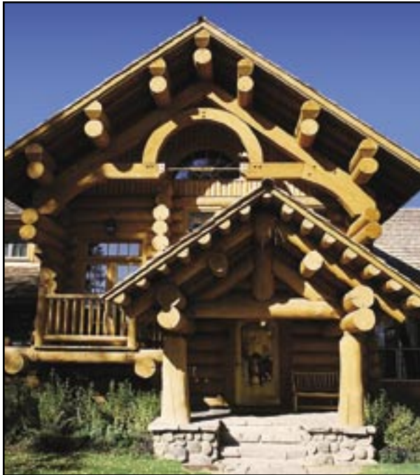
Unique Timber Corp. / EDG Architects