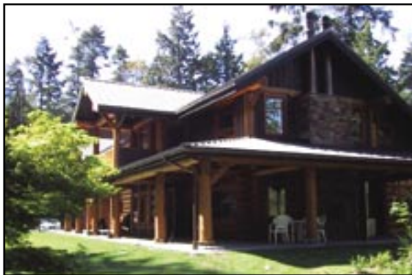
Nicola Logworks Limited / Sortun-VOS Architects