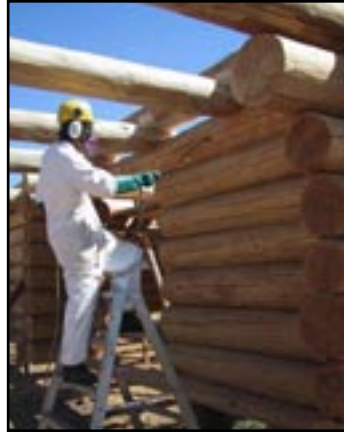
Nicola Logworks Limited

In sawmills, sapstain control products are usually sprayed on lumber, but can be applied by dipping as well. On logs they would be most effective when ap-